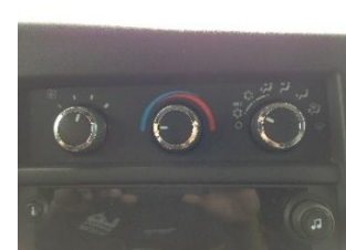
FRONT A/C CONTROLS