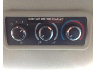
REAR A/C CONTROLS (NEW PIC)