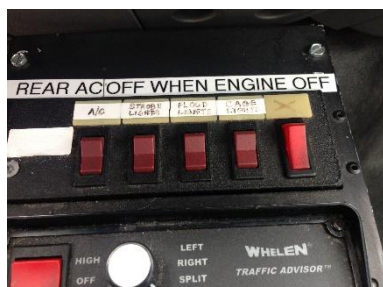
REAR A/C CONTROL