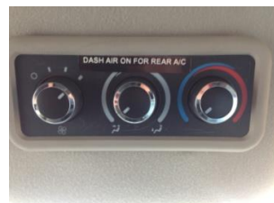
REAR A/C CONTROLS (NEW PIC)