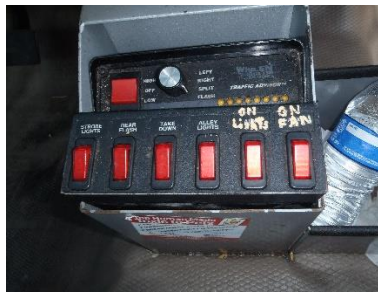
FAN (BLOWER) CONTROLS