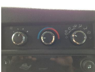
FRONT A/C CONTROLS