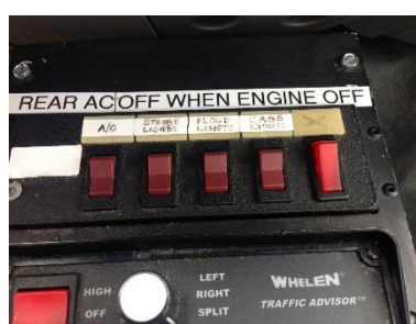
REAR A/C CONTROL