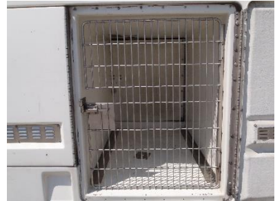
FIBERGLASS COMARTMENT & SIDE DOOR VENTS

This unit is equipped with a fan switch on the control box pictured above. The fan switch activates a blower unit (non A/C) connected to the fiberglass compartment which moves air through the compartment. The blower unit works whether the truck is running or not.