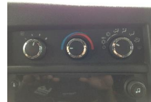
FRONT A/C CONTROLS