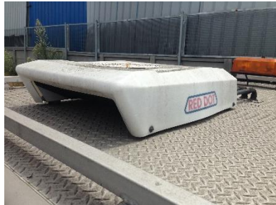
"RED DOT" A/C UNIT