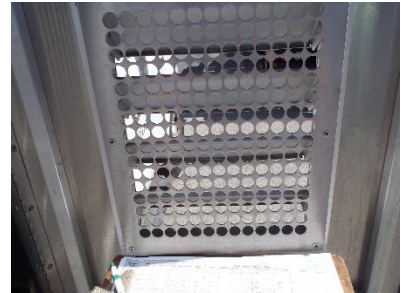
INSIDE DOOR VENT

This unit is equipped with an air conditioning (A/C) switch on the control box pictured above. The A/C switch activates an independent a/c unit connected to the metal compartment which moves air through the compartment. The A/C does NOT work when the truck is not running. The unit will continue to run and blow air without A/C if the truck is not running.