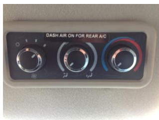
REAR A/C CONTROLS