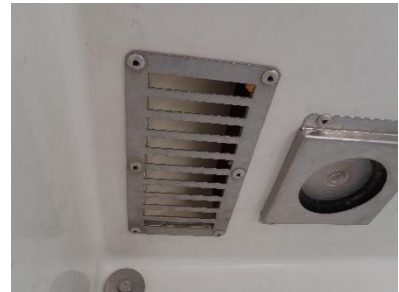
INTERIOR AIR VENT