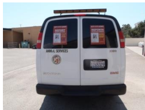
VAN REAR (NEW PIC)