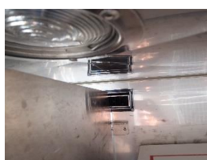
SHARED A/C VENT