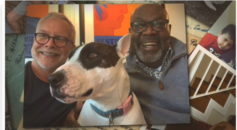
LA Animal Services - Giving Thanks to All of You

World Spay Day mini-campaign activated segment of donors that give to spay and neuter.